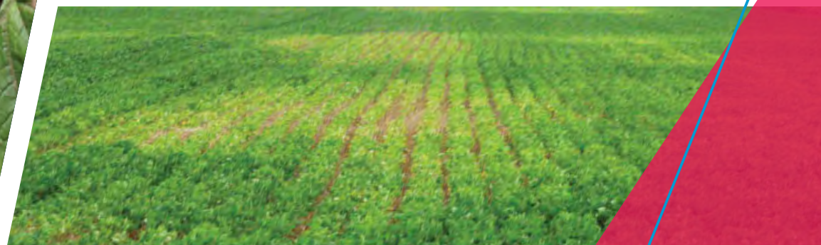
Fig. 1 - Symptoms on soybeans

// Migratory Nematodes e.g. Pratylenchus spp., Ditylenchus spp., Radopholus spp. and spiral nematodes