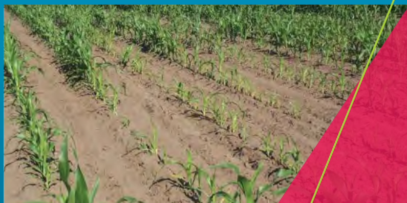
(Fig. 3 - Symptoms on maize).

The use of tolerant cultivars and non-hosts to target nematodes contribute significantly to reducing such pest populations. However, the traditional crop rotation systems applied in South African agricultural areas are conducive to the build-up of high numbers of target nematode pests such as root-knot and lesion nematodes. For example, crops such as potato, dry bean, soybean, sunflower, other vegetable crops (except some Brassicaceae cultivars) are highly susceptible to root-knot and lesion nematodes.