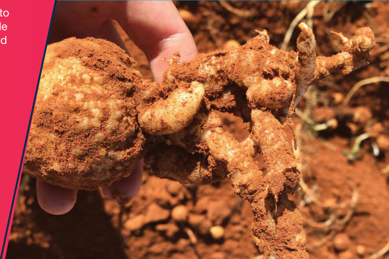
Fig. 2 - Symptoms of galls on potato