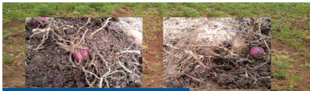
Potato crop affected by potato cyst nematode

In an infested field, the potato crop will look stunted, yellow in colour and result in low yields of poor quality.